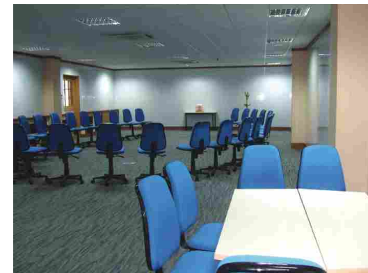
VSME learning facility at Mumbai