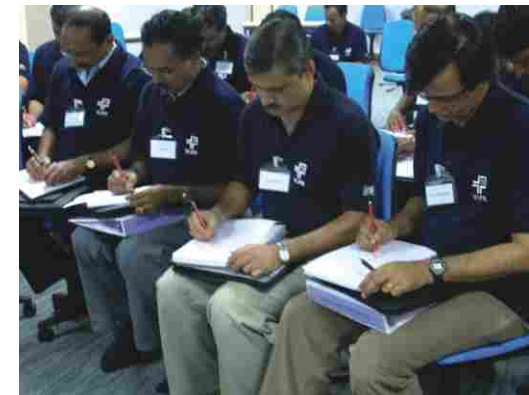
Participants engrossed in self discovery