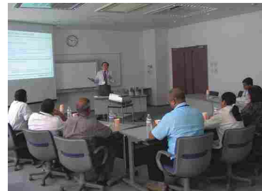
VSME Planning team at Panasonic, Osaka