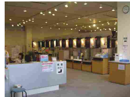
SME Products display facility ,Higashi Osaka