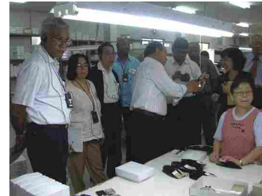
Planning team at Socks Manufacturing SME at Osaka

The Programme implementation approach will be similar to the Cluster Approach. The first Module will be held at the CII Naoroji Godrej Centre of Excellence. The 2nd, 4th and 5th Modules will be held at one of the participating companies, as done in the Cluster programme. Module 3 will take place in Japan.